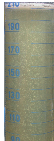
Optimal ratio of yeasts / CLARIFIANT XL™

In general, for optimal riddling, we advise a quantity of 0,04 to 0,05g of bentonite/bottle.