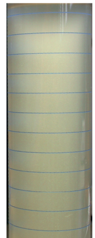
Too much yeasts with respect to the quantity of CLARIFIANT XL™